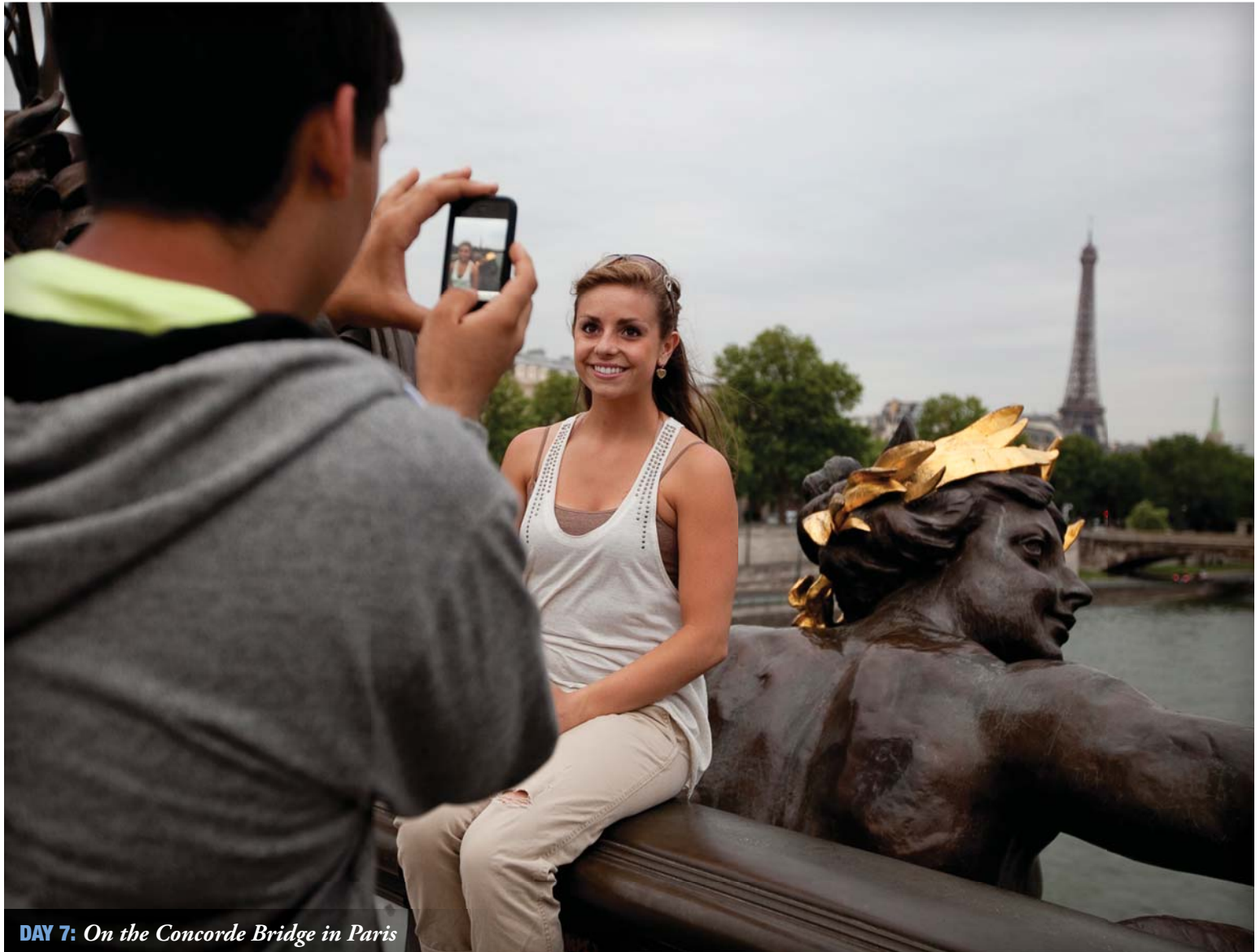
DAY 7: On the Concorde Bridge in Paris