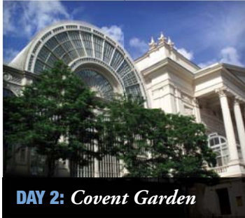
DAY 2: Covent Garden