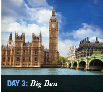
DAY 3: Big Ben