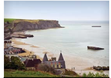
DAY 8: Normandy coast