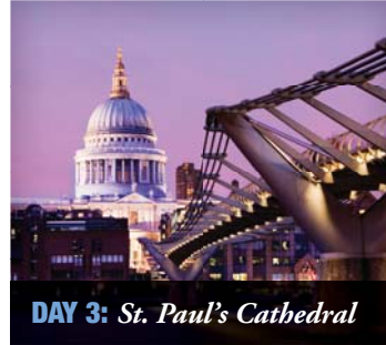
DAY 3: St. Paul's Cathedral