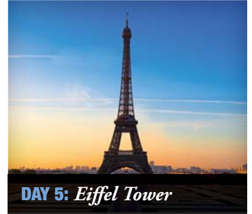
DAY 5: Eiffel Tower