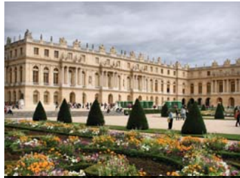
DAY 6: Versailles