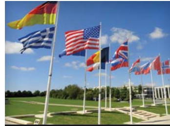
DAY 8: Caen Memorial